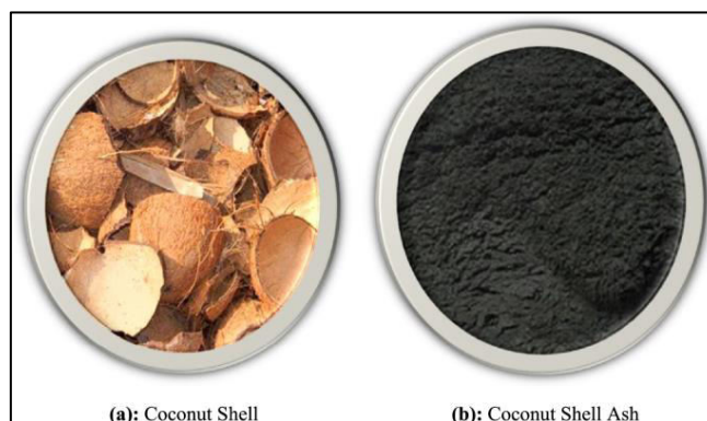
Fig 2 Materials Density(kg/m3)

Coconut is a non-fossilized, biodegradable organic material that may replace fossil fuels and supplement other renewable energy sources burning either fossil fuels or biomass releases CO 2 . However, according to a study conducted by, coconut shell-derived energy can save 18.3% of GHGs emission that causes global warming, 64.1% of the same emission that results in ozone depletion, and 71.5% of non-renewable energy consumption.