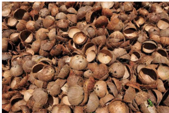
Fig 1 Coconut Shell